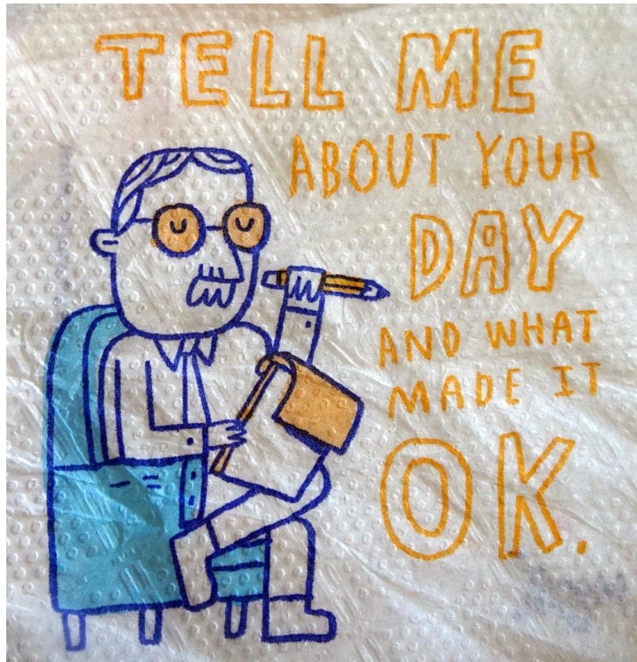
Marina Bluvshstein, ICASSI 2017