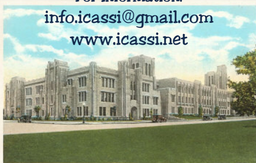
ARTHUR JORDAN MEMORIAL HALL. BUTLER UNIVERSITY, INDIANAPOLIS, IND.